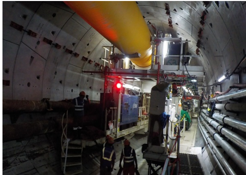
MTRC 1128: Causeway Bay Typhoon Shelter to Admiralty Tunnels